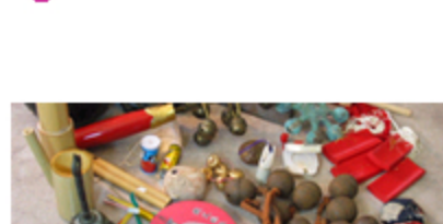
Examples of small sound objects