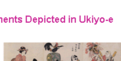
Children playing at a festival by Kikukawa Eizan, c.1780, Ota Memorial Museum of Art